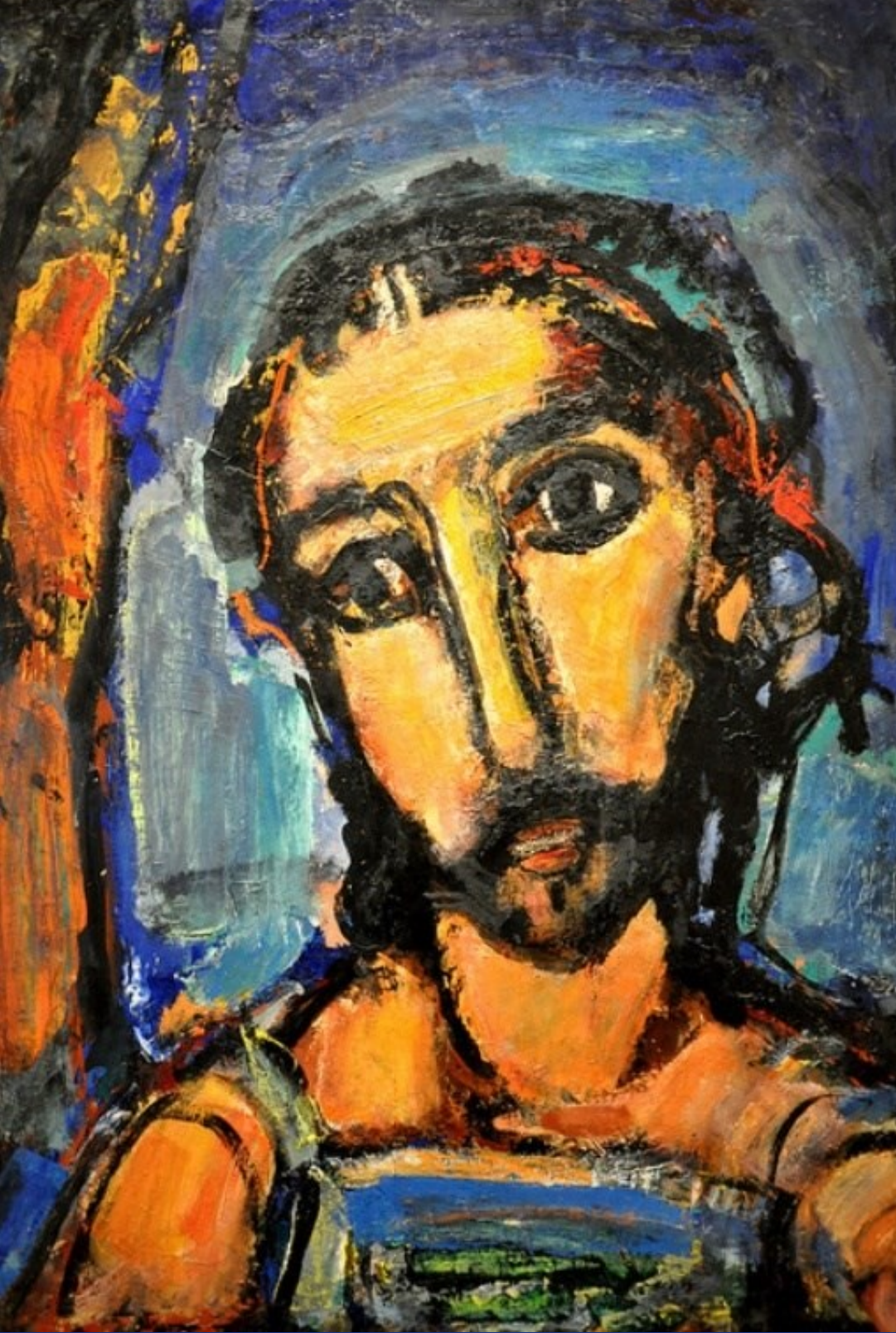
Georges Rouault, "Head of Christ," 1937, Paris.

First Presbyterian Church 1903 Church Street Galveston, TX 77550 Phone: 409-762-8638 www.galvpres.net www.facebook.com/FPCGalveston beckydowns@galvpres.net secretary@galvpres.net